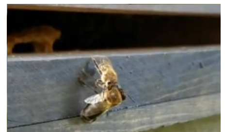
A worker ejects a drone.

Place a non-metallic dish (saucer or similar container) on the top of the frames of the top box. Very carefully,