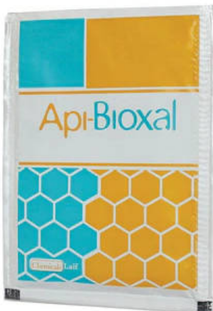
Approved medicines only please