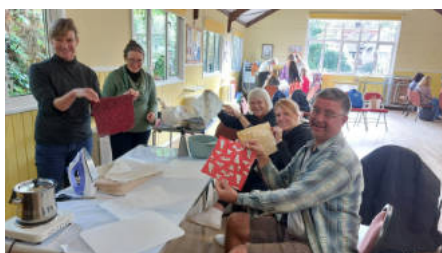
A peek at the 2024 wax workshop

In the autumn, we have set up wax workshops for beekeepers and non-beekeepers to learn ways to use beeswax and honey for use at home and for personalised gifts.