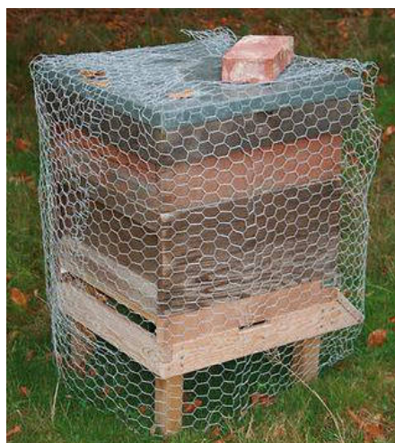
Chicken wire mesh: woodpecker deterrent

Guard against other pests such as mice and Green Woodpeckers. Mice can wreak all sorts of havoc in a hive if left unchecked but can be dealt with by fitting a mouse guard or reducing the size of the entrance. They may have very supple bodies but the one thing they can't manipulate is their skulls, so if you reduce the entrance to about 9mm in depth, it should keep the blighters out. In some areas, Green Woodpeckers have learnt that beehives are a good source of food later in the year. Woodpeckers do as much damage inside the hive as mice, with the added bonus of a hole drilled