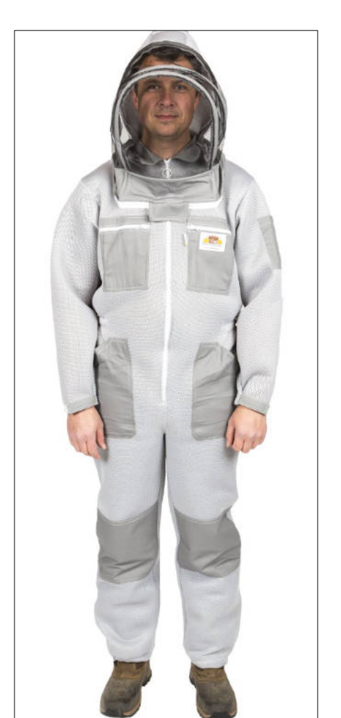
Sting-proof suit—Sentinel II

Check the underside of the board to make sure the queen is not sitting on it; it's unlikely but bees don't read books.