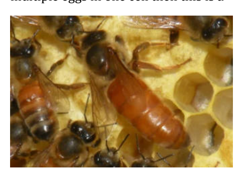
A lovely but unmarked queen

If these are all present, then she's in there somewhere. Note; if you see multiple eggs in one cell then this is a