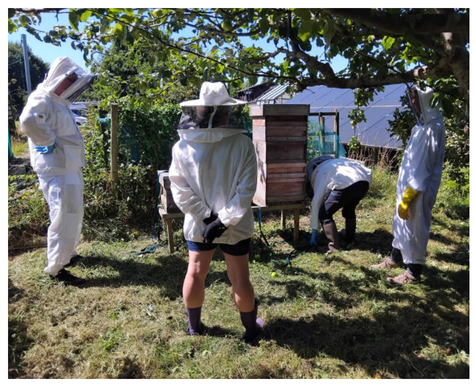
Hove apiary.