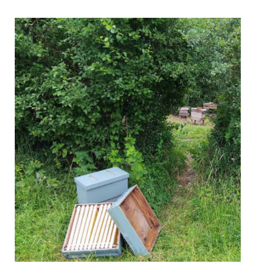
Grassroots apiary.

From April to the end of August, at least one of the teaching apiaries will be open for business. The teaching apiaries are supporting some of our newer beekeepers for basic assessment, honey bee health study group sessions, queen rearing or for beginner beekeepers.